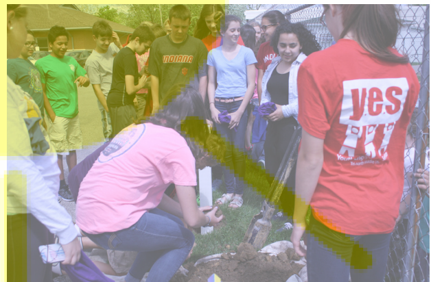
The YES Club from Tri North Middle School installing a Little Free Library at MCUM.