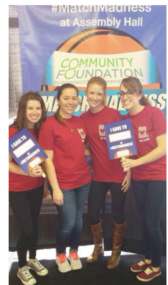
Volunteers at our Match Madness donor event in March, 2015