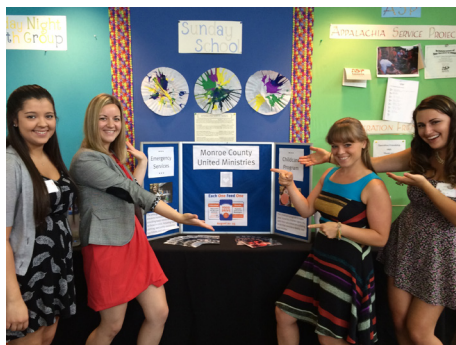
MCUM's Development Team with their display at the United Methodist Women's Fashion Show, July 2015.

MCUM was founded by several local congregations in effort to provide services for children from low-income families living on the Northwest side of Bloomington. Today, MCUM is still heavily-supported by the local faith community. We are grateful for these continued and new partnerships.