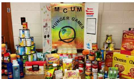
United Presbyterian Church's youth group's Hunger Games display, April 2015. UPC was the MCUM Hunger Games Champion last year.