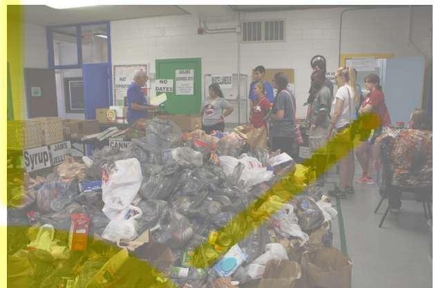
More than 200 volunteers helped make our 2015 Each One, Feed One community food drive a huge success!