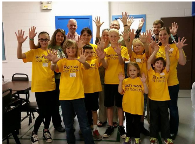
Members of St. Thomas' youth group pose during a volunteer session last fall.

St. Mark's United Methodist Women St. Paul United Methodist Church St. Thomas Lutheran Evangelical Church Stoneybrook Community Church of God Trinity Episcopal Church Unitarian Universalist Church United Presbyterian Church University Baptist Church Woodhaven Christian Church Woodhaven Christian Church, CWF