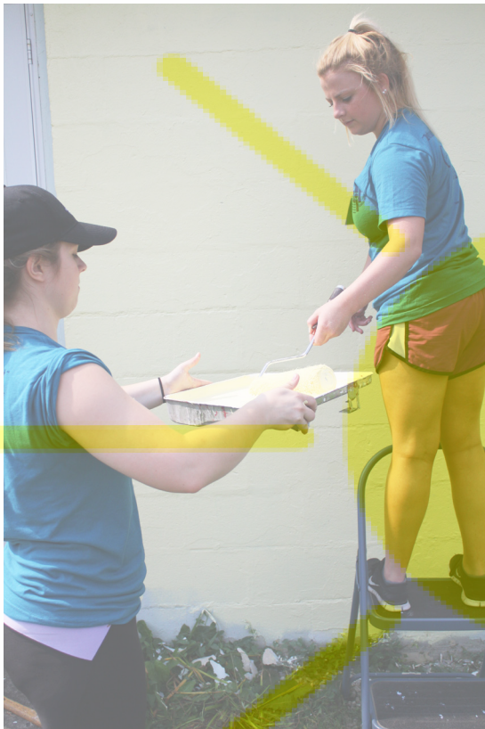
Last year, volunteers from UIFC helped with many painting projects.